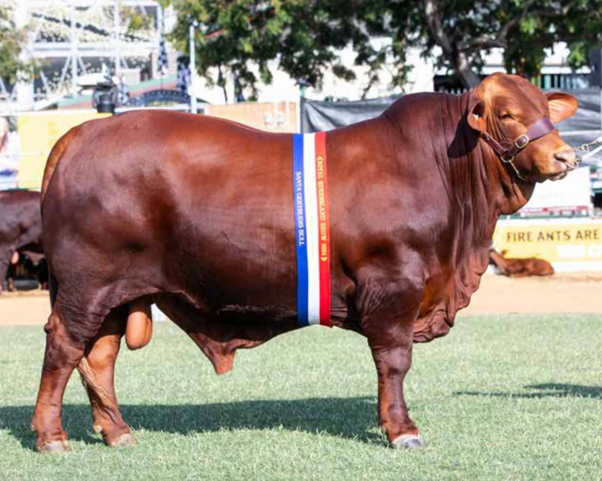
EKKA 2024 GRAND CHAMPION SANTA GERTRUDIS BULL Santahat Ultimate U300 (P)